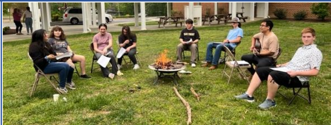
The Beulah Youth (Belong) worshipping outside during youth group.