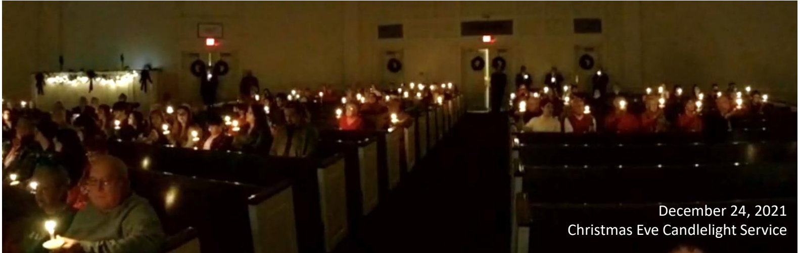
December 24, 2021 Christmas Eve Candlelight Service

Transforming Lives As We Seek, Share, And Serve God.