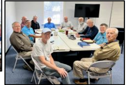
Men's Bible Study