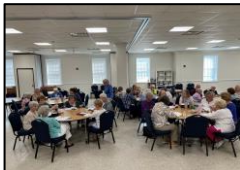
Jesus and Women Study